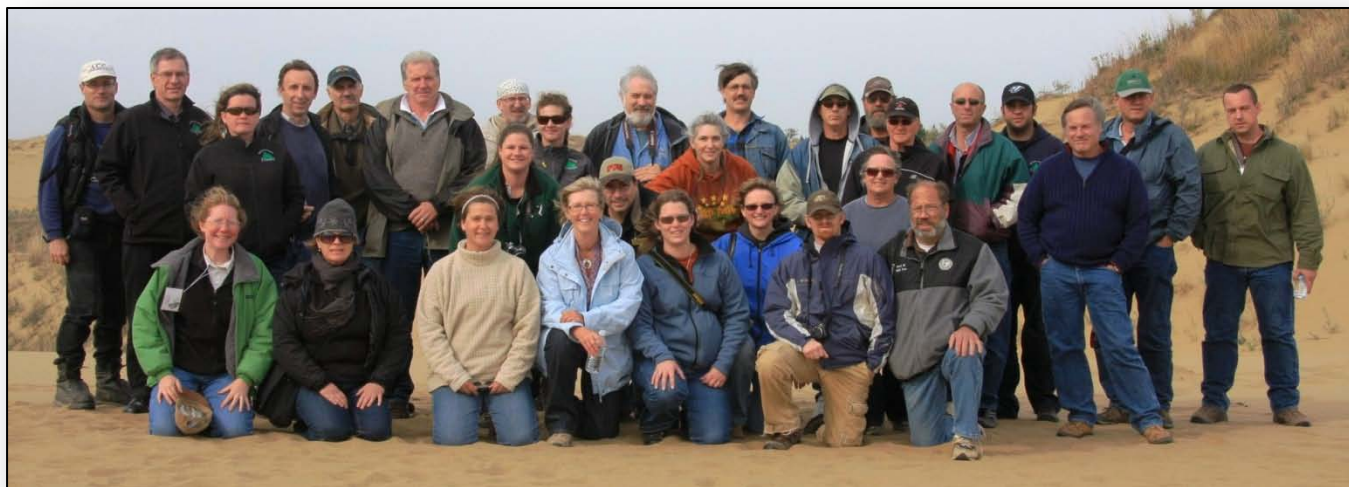
NCFPW 2009 Group photo, taken on the field trip, at the sand dunes from ancient glacial Lake Agassiz.