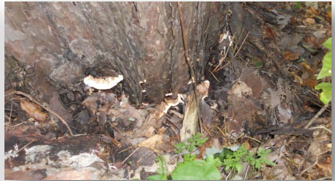
Classic symptoms of a Heterobasidion Root Disease pocket in a red pine stand at Proud Lake State Recreation Area (left). Conk of H. irregulare near the base of a dead red pine (above).