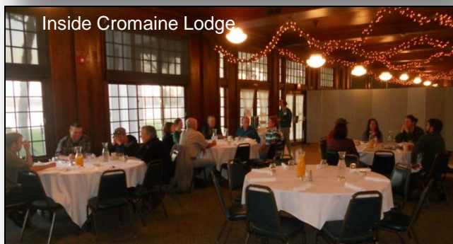
Inside Cromaine Lodge