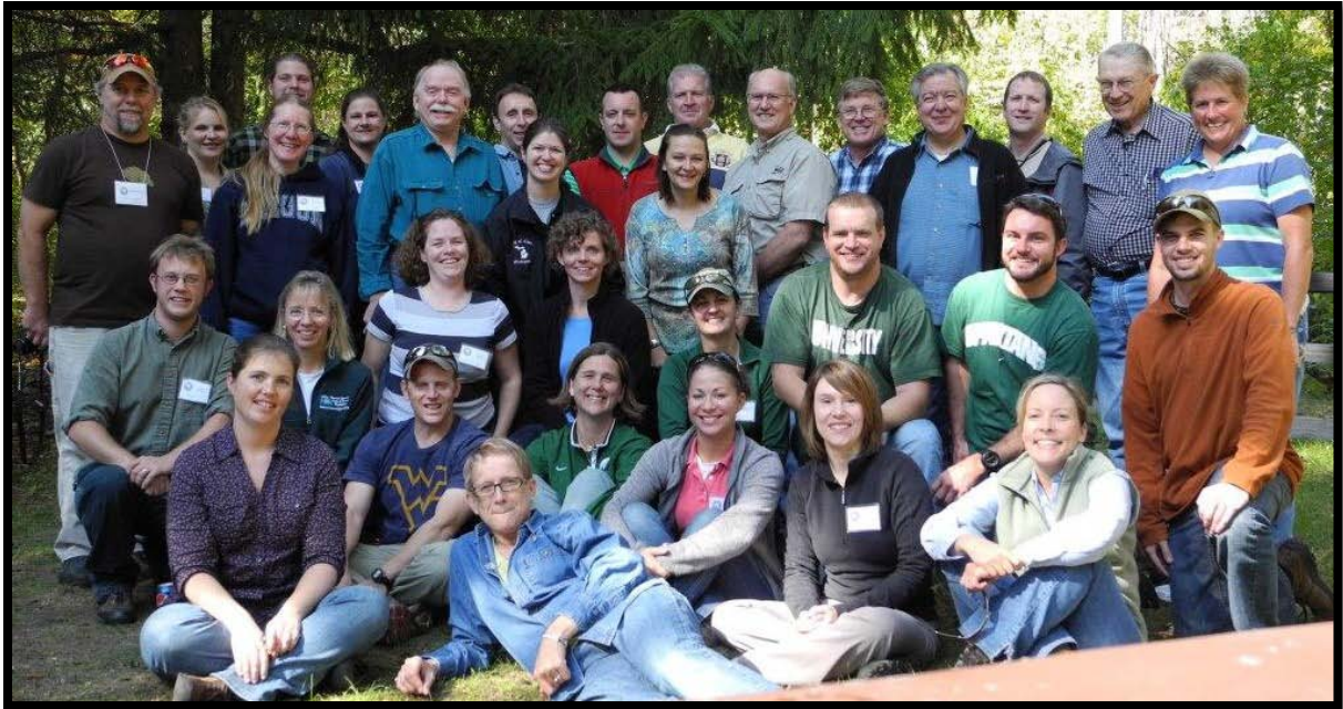
NCFPW 2011 Group photo, taken on the field trip.