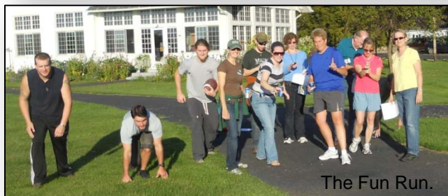
The Fun Run.